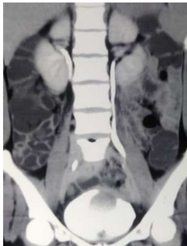
Fig-1: Coronal view of anterior wall urinary bladder tumour in CECT

documented large anterior urinary bladder wall growth (Figures 1, 2).